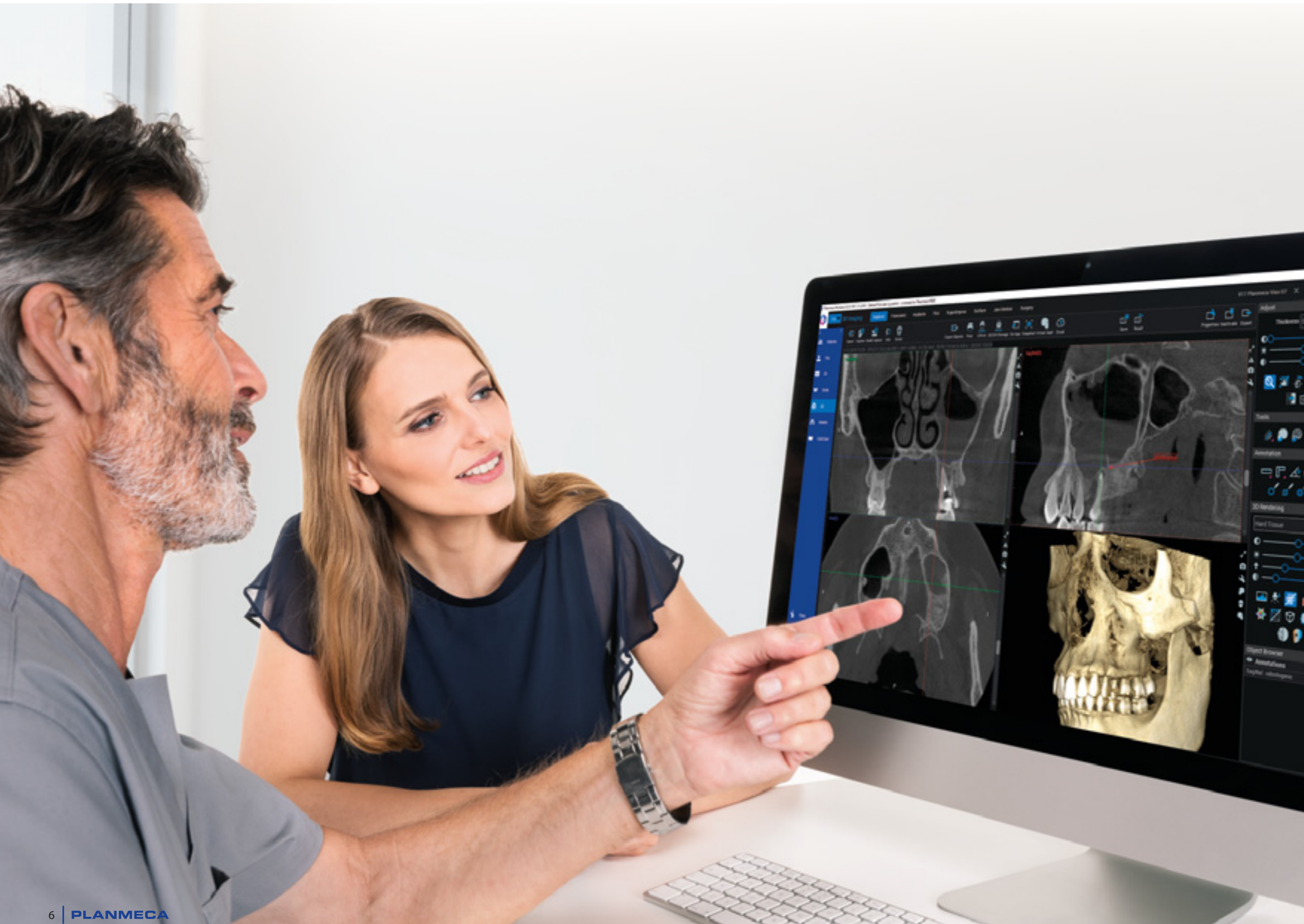
Image quality is among the most important factors in CBCT imaging. Planmeca Viso™ units shine in this area, as they allow you to capture crystal-clear images in all situations. Options for ultra low dose imaging, patient movement correction, noise removal, and metal artefact reduction are available as standard features.